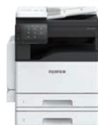
With Tray Module