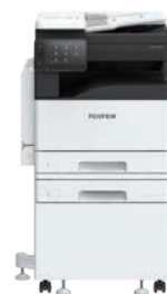
With Tray Module and Cabinet*

* Tray module is required for Cabinet installation