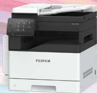
Apeos C2450 S Standard Model