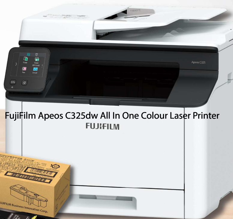
Fujifilm Apeos C325dw All In One Colour Laser Printer FUJIFILM