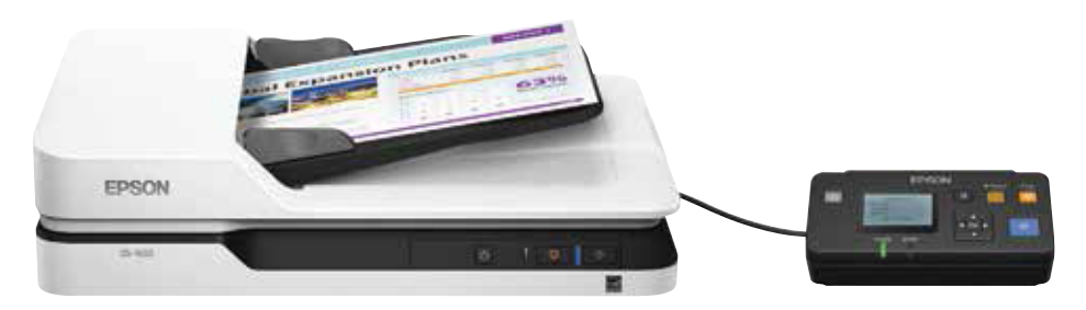
Network scanning requires optional Network Interface Unit Sold Seperately

DS-1630 Scanner B11B239501 Network Interface Unit B12B808441 Extended Service Plan (3YRS) 3YWDS1630